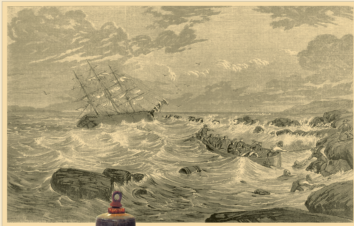
The ship's bell, inscribed 'Netherby 1858', survived the shipwreck.