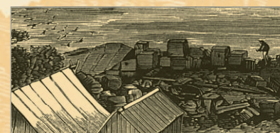
Pictured above, and a detail at left: Loading salvage from the Blencathra at Currie harbour, as shown in the Illustrated Australian News , 24 March 1875.

“And yet, by some unaccountable means, 75 cases evaporated the first night, even the cases themselves disappearing.”